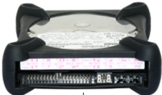
3.5" HDD not included